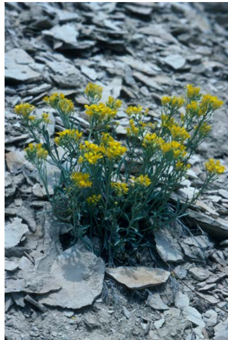
Piceance twinpod