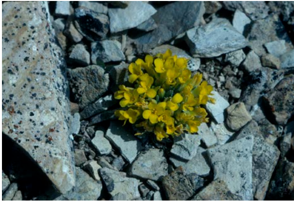
Dudley Bluffs bladderpod © B.Jennings